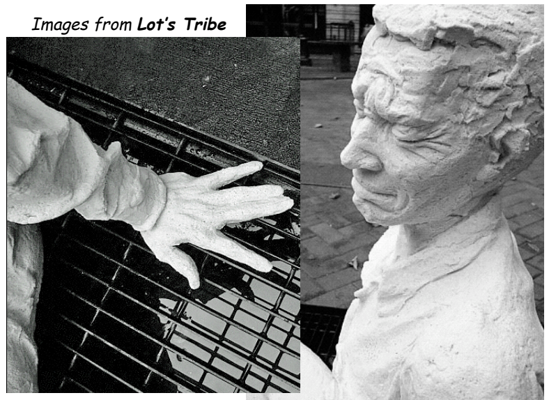
Images from Lot's Tribe

PS. Don't forget that it's dues time. Send them in now, along with a renewal form, (in this newsletter or available on the website), and you'll save us a stamp as we won't have to send you an invoice.